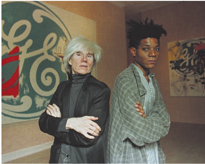
Andy Warhol was one of the most influential painters of the 20th century. His colleague, Jean-Michel Basquiat, was also an extremely promising artist. His addiction to heroin, which led to a fatal overdose, provides one example of the destructive impact of mental disorders.